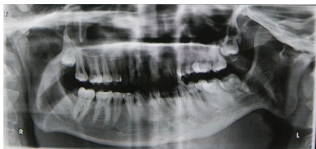
Figure-3: Panoramic image showing shortened mandible, deep antegonial notch, reduced joint space and elongated coronoid on the left side.