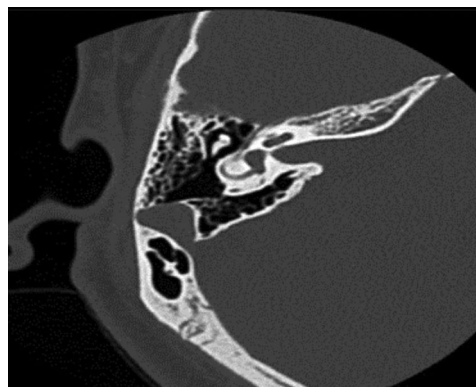
Figure-2: Bulging or anteriorly placed