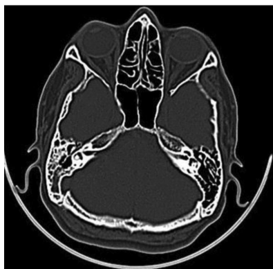
Figure-1: Right Koerners t

340 temporal bones of 170 patients were recruited in the study. HJB was encountered in 80 ears (23%) and it was bilateral