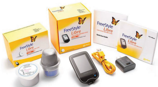
Figure-3: Parts of FreeStyle® Libre™ Flash Glucose Monitoring System kit.

Bailey T et al evaluated the performance and usability of the FreeStyle® Libre™ Flash glucose monitoring system (Abbott Diabetes Care, Alameda, CA) for interstitial glucose results compared with capillary blood glucose results. Interstitial glucose measurements with the FreeStyle® Libre™ system were found to be accurate compared with capillary BG reference values, with accuracy remaining stable over 14 days of wear and unaffected by patient characteristics. 16