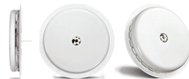
Figure-2: A disposable Sensor