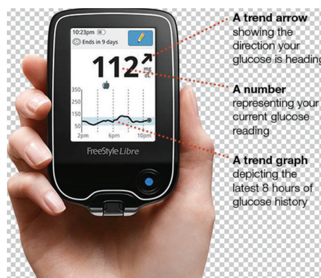
Figure-1: A handheld Reader